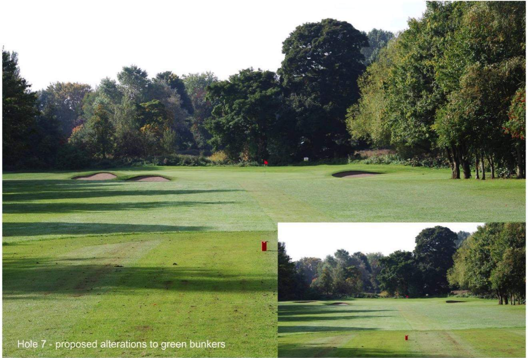
Hole 7 - proposed alterations to green bunkers