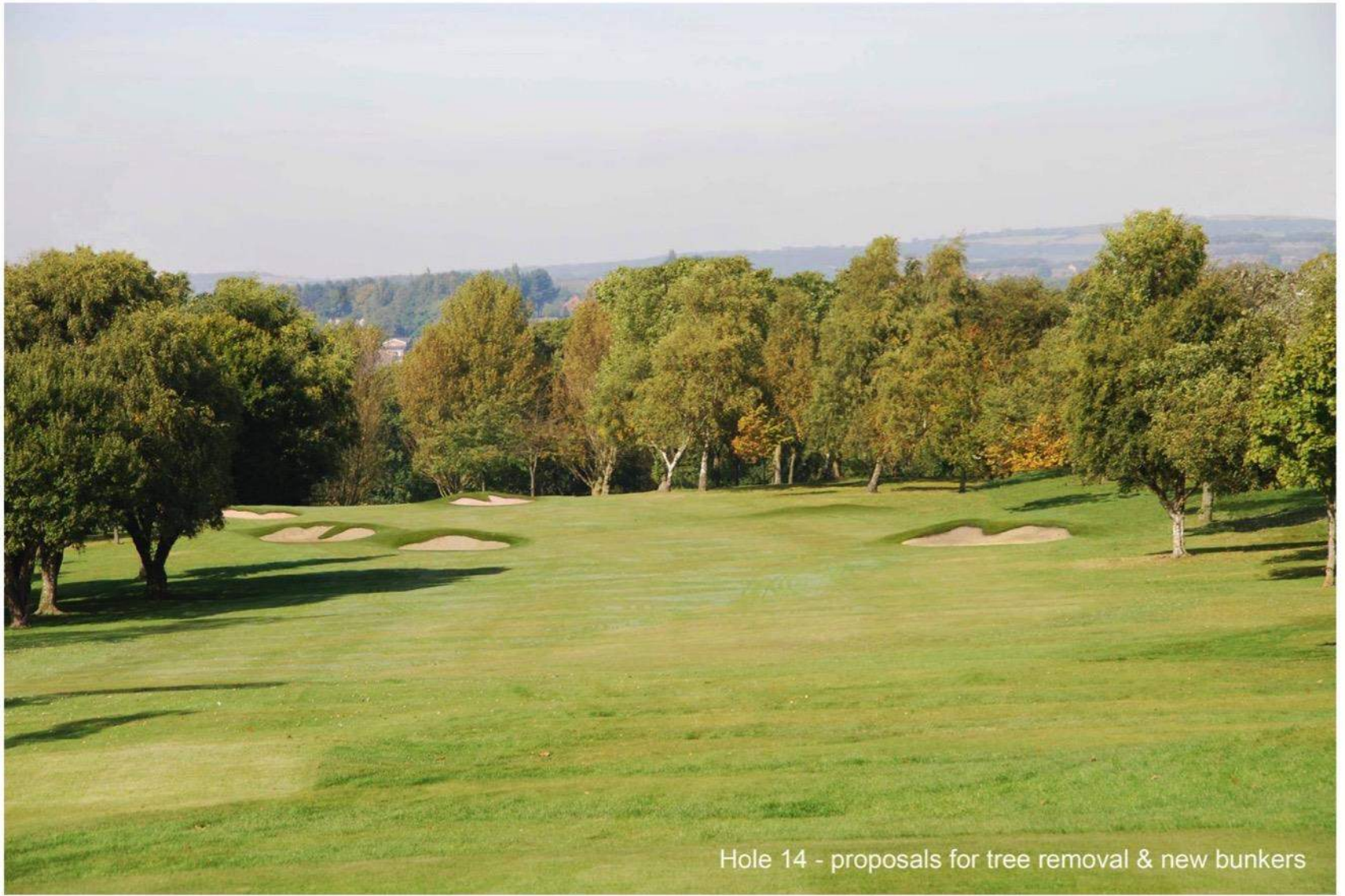
Hole 14 - proposals for tree removal & new bunkers