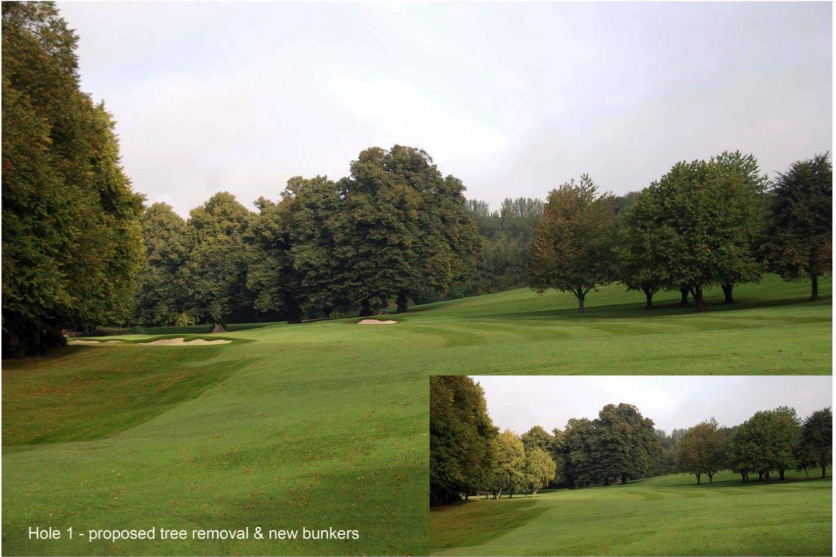
Hole 1 - proposed tree removal & new bunkers