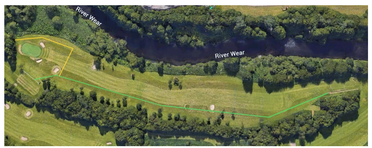
7<sup>th</sup> Hole Keep to the rough on the left of the hole. Walk to the green and exit the hole to the left.

If the 7<sup>th</sup> winter mat is in play, exit the hole in front of the approach bunker and keep to the rough to the right of the approach and green.